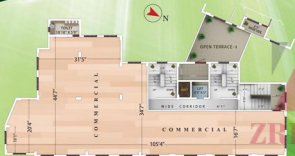
Block A commercial First Floor Plan