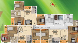
Block A Typical 2nd To 7th Floor Plan